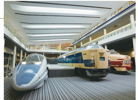
Kyoto Railway Museum

Kyoto Kawaramachi Sanjo Tourist Information Corner, Kyo KOKO Welcome Center.