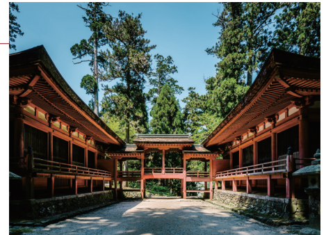
Hieizan Enryakuji Temple (Ninai-do)