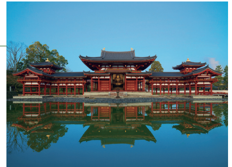
Hoo-do Hall of Byodo-in Temple

[Sales period] April 1 (Sun.), 2018 - March 31 (Sun.), 2019