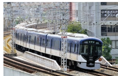
New 3000 Series rail cars

*Our regenerative brake cars and VVVF control cars are considered energy-efficient railway cars.