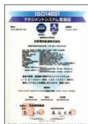
Certificate of registration with ISO 14001 standards for environmental management systems