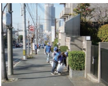
Environmental clean-up initiative

In 2004, we became the first railway company in Japan to acquire company-wide certification of ISO 14001 registration. As part of our commitment to environmental stewardship, we have been engaged in a variety of initiatives such as participating in clean-up campaigns along our domain and recycling tickets and other materials. Going forward, we will continue to contribute to society by further emphasizing individual environmental preservation initiatives.